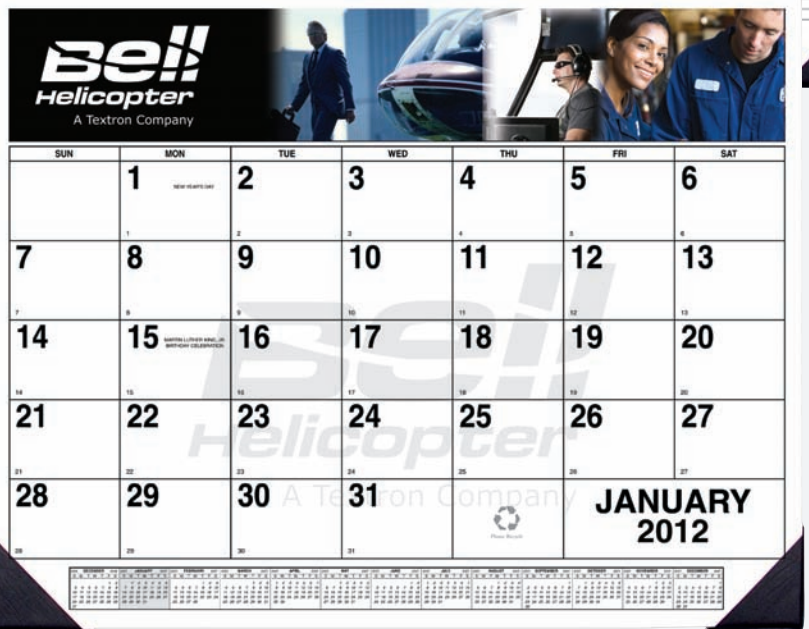
DNP-1H: Leatherette Date/Note Desk Pad