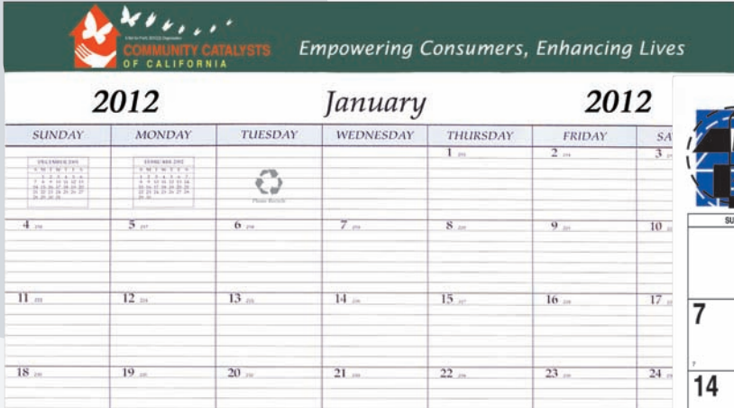
APP-1H: Leatherette Desk Pad